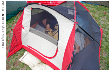
TIM O'BRIEN/STUDENT MEDIA